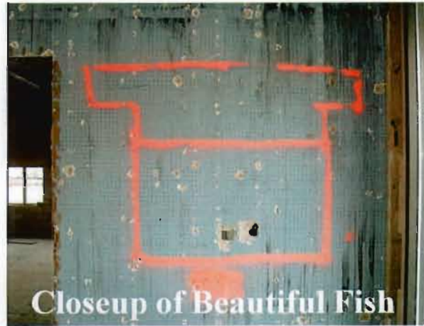
Closeup of Beautiful Fish