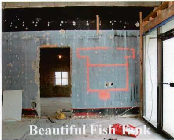
Beautiful Fish Tank