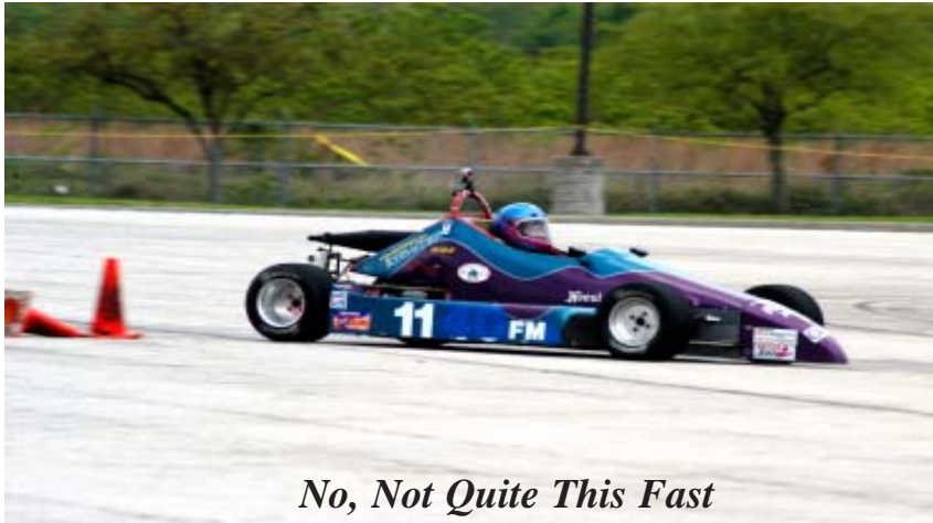
No, Not Quite This Fast

There is an easy way to find out however how fast your internet connection is. Just point your browser (Explorer or otherwise) to: